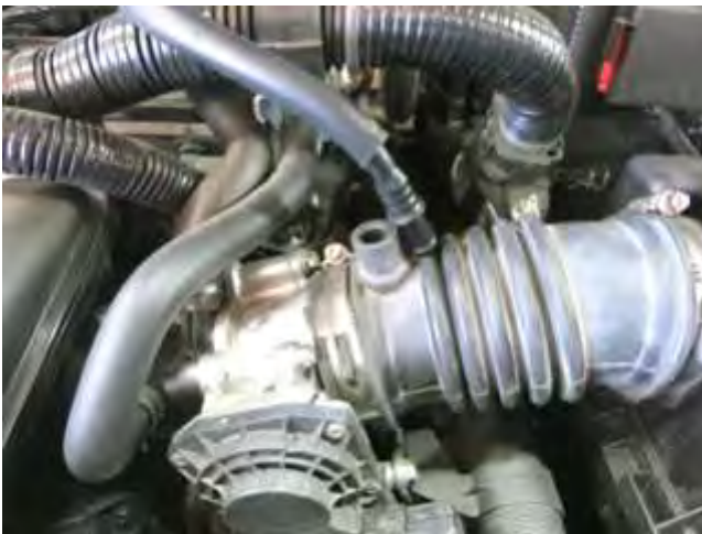
c. Use a 7mm socket and ratchet to loosen the throttle body hose clamp. Then, pull the PCV line out from the nipple on the intake hose.