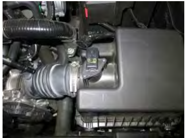
b. Unplug harness from MAF (Mass Air Flow) sensor.