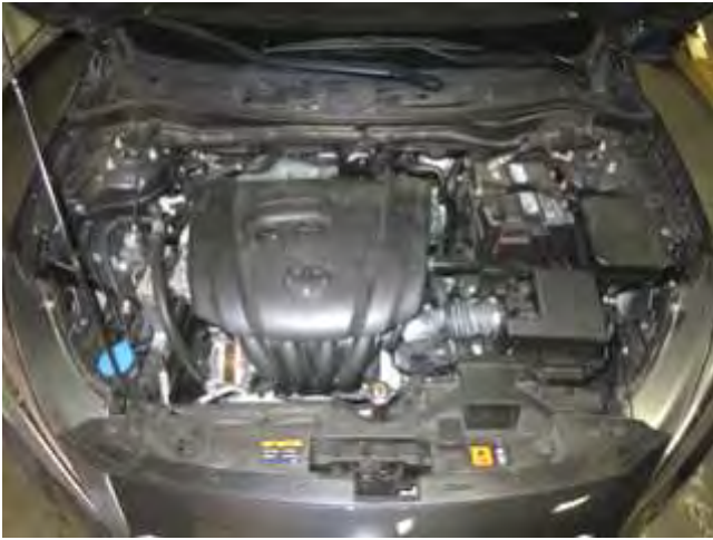
STOCK INTAKE INSTALLED