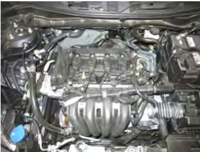
a. Carefully pull up on the engine cover and remove it.