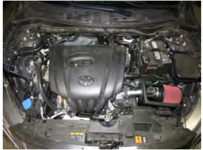
AEM INTAKE INSTALLED