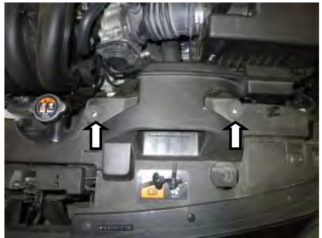
d. Use a 10mm socket and ratchet to remove the (2) M6 bolts holding the intake snorkel to the radiator shroud. These bolts will be reused in step 3f.